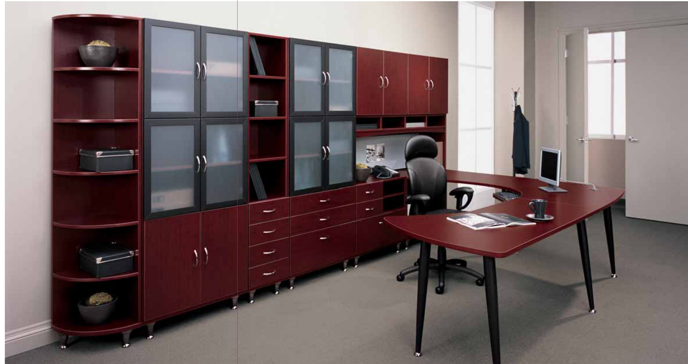
Shown in Tiger Mahogany with Black Nickel trim and Azeo seating

To complete your personalized workstation, options include silver or black tapered legs, casters, feet, drawer handles, and door frames. Units accepting doors offer solid laminate or glazed styles, including clear, frosted or "rice paper" glazing for a complete workspace that looks as good as it works.